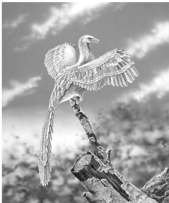
Archaeopteryx was fully bird, with an avian skull, lung system and fully-formed flight feathers. According to uniformitarian 'dating' methods, Archaeopteryx is older than its supposed dinosaur ancestors but younger than more 'modern' birds.

When Archaeopteryx was discovered in 1861 (two years after