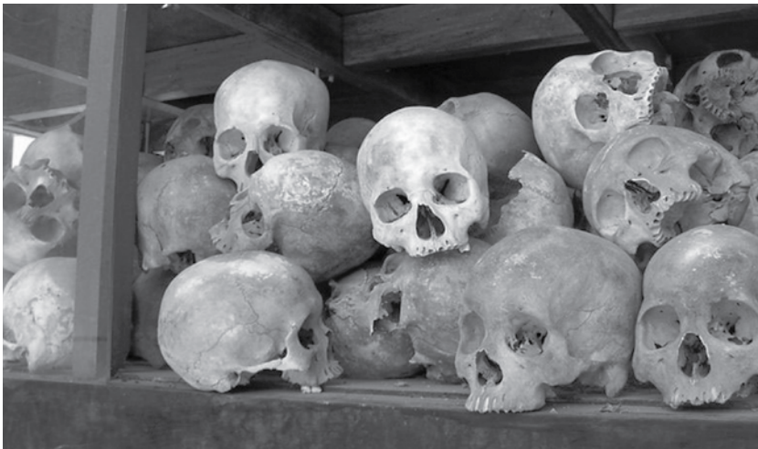
Figure 3. Well over 500,000 people died during the Khmer Rouge’s reign in the 1970s. The extermination of political adversaries and of entire social groups is a normal practice amongst communist regimes. Such a bloodbath is the by-product of a materialistic worldview that deems the most powerful to be the ultimate arbiters of right and wrong.

The persecution and extermination of the Jews was as much a consequence of ideological tenets, held sacred by the Nazi zealots, as the destruction of the ‘kulaks’ during the Stalinist collectivization campaigns. Millions of human lives were destroyed as a result of the conviction that the sorry state of mankind could be corrected if only the ideologically designated ‘vermin’ were eliminated. This ideological drive to purify humanity was rooted in the scientific cult of technology and the firm belief that History (always capitalized) had endowed the revolutionary elites ... with the mission to get rid of the ‘superfluous’ populations ...” 52