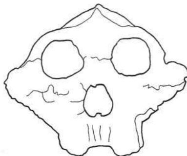
KNM-ER 406 ( Paranthropus boisei ), from Koobi Fora, Kenya.