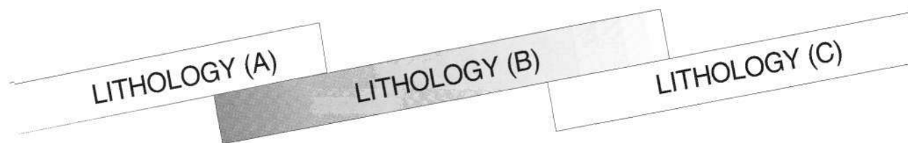
Figure 2. It has been argued that strata should be counted as stratigraphically superposed because strata can overlie each other through a series of overlaps like the tiles of a gabled roof. However, strata change in character laterally over long distances and the horizons of supposed geologic time cut across lithologies. So regional overlapping cannot be empirically counted as superposition.

I think that we best treat this claim with the proverbial grain of salt.