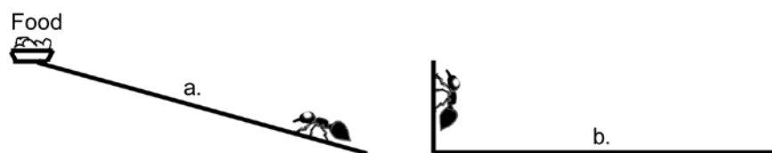
If ants trained to find food at the end of a ramp (a) also hunted for food at the top rather than the base of an L-shaped section (b) this would show that ants integrate in three dimensions rather than just projecting their position onto a horizontal plane.