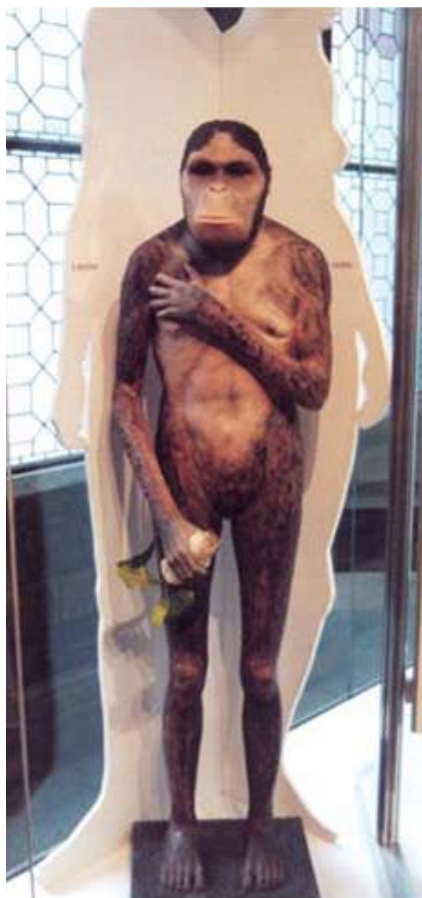
Museum displays of ‘Lucy’ are misleading. Note that the hands and feet look very human, but the actual bones have not been found. Bones from other Australopithecus specimens indicate a knuckle-walking ape.

When Lucy first arrived on the scene, news magazines such as Time and National Geographic noted that she had a head shaped like an ape, with a brain capacity the size of a