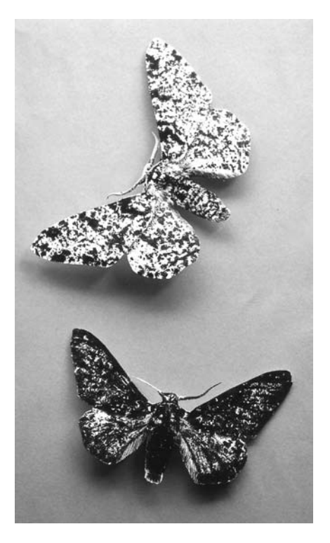
Light and dark (melanic) forms of the peppered moth Biston betularia. This popular textbook example of 'evolution in action' is fraught with problems. A change in gene frequencies does not amount to an increase in complexity.

'However, approaching the question from an unprejudiced stance—not trying to defend a traditional creationist [in the context: belief in species fixity] or traditional