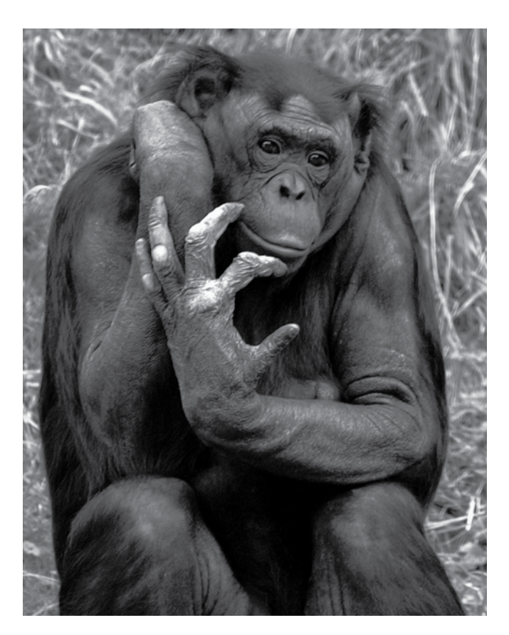
The bonobo's abilities seem closer to that of humans, but the gap is still formidable, with no evidence of continuity.

The ape studies would never be able to explain why apes don't express any sort of linguistic abilities on their own. They would only show that apes had somehow unexpressed linguistic abilities, that is, but only if they succeeded in