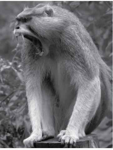
Monkeys have interesting abilities to discern and produce language-like sounds, yet lack the syntactic abilities that all humans possess.

DeGraff cites the French linguist, Lucien Adam (an ironic twist), who classed languages into 'natural' (those spoken in the wild by savages) and 'civilized' languages, those used in civilized, European cultures. No one has to point out the cultural bias in such statements, but it is worth noting that in the case of creole languages, we are, in fact, discussing spoken languages. We are not comparing literatures that took centuries to develop with oral traditions that may have emerged within a few generations. In the case of the evolution of European languages, the empirical evidence simply does not sustain a belief in any sort of evolutionary perspective.