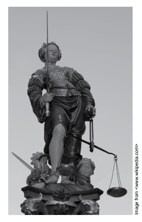
Law courts—flawed justice

Anti-creationists often say that creationism should be taught in non-science classes such as social