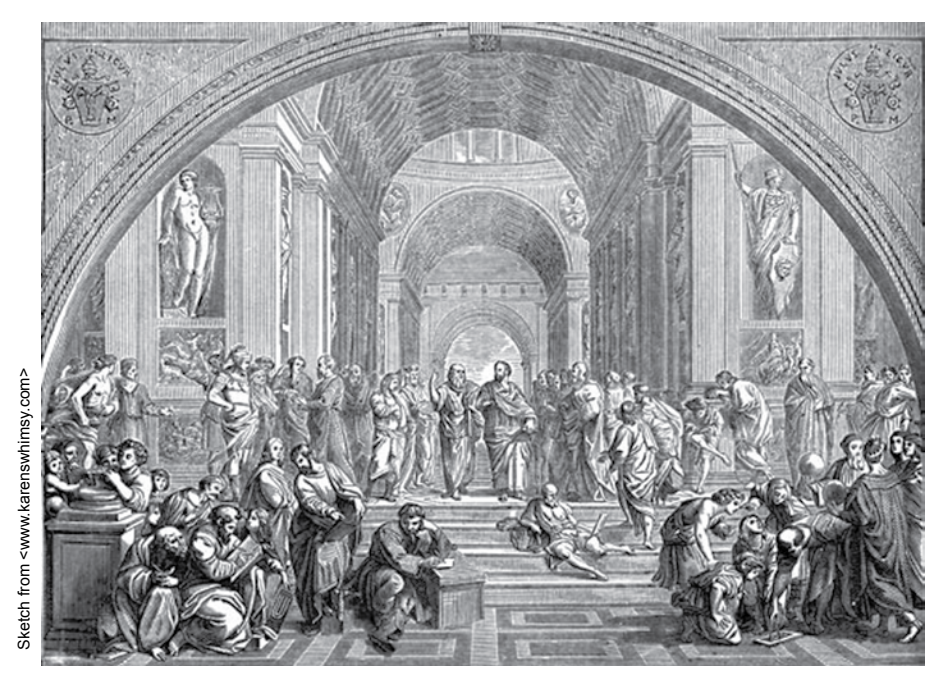
The School of Athens. Schools of learning—education or indoctrination?