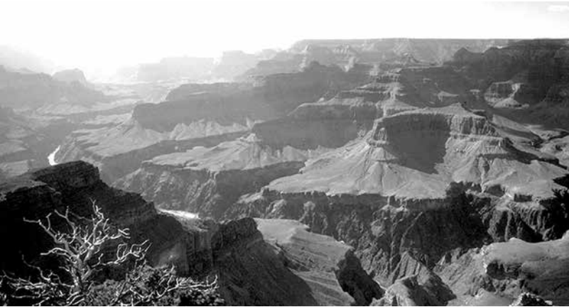
If ‘Lucifer’s flood’ created this, then what did Noah’s Flood do?