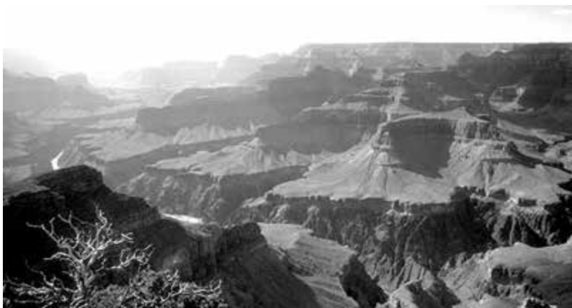
If ‘Lucifer’s flood’ created this, then what did Noah’s Flood do?