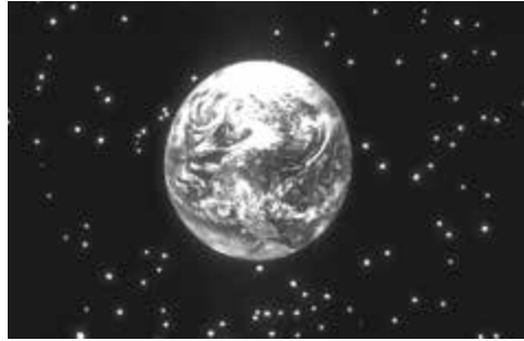
God created everything in six days. (Exodus 20:8–11)

9. Some have attempted to use Jeremiah 4:23 to teach the gap theory, because it uses the same phrase, tohu va bohu , to describe the results of a judgment. Gap theorists like Arthur Custance used this to assert that ‘without