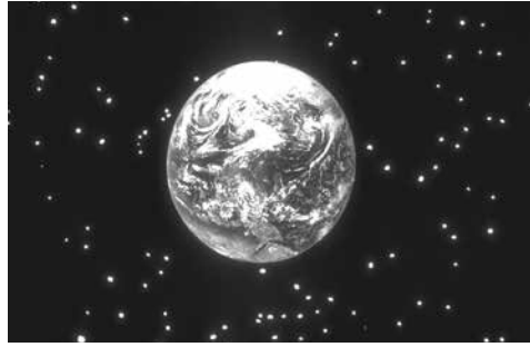
God created everything in six days. (Exodus 20:8–11)

form and void’ must mean ‘laid waste by a judgment’—so that use of these words in Genesis 1:2 must mean that Earth suffered a judgment. But this is fallacious—there is nothing in the Hebrew words tohu va bohu themselves to suggest that. The only reason they refer to being ‘laid waste’ is due to the context in which the phrase is found in Jeremiah 4. The words simply mean ‘unformed and unfilled’. This state can be due either to nothing else having been created or some created things having been removed. The context of Jeremiah 4 is a prophecy of the Babylonians attacking Jerusalem, not creation. In fact, Jeremiah 4:23 is known as a literary allusion to Genesis 1:2—the judgment would be so severe that it would leave the final state as empty as the earth before God formed and filled it.