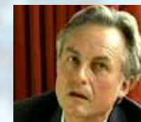
Professor Richard Dawkins

Single-celled organisms have much less information in their DNA than a human does. If the complex evolved from the less complex, information had to have been added.