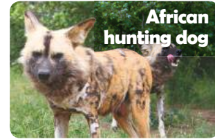
African hunting dog

For the theory of evolution to work, such as in microbes evolving into humans (“goo-to-you” evolution), it requires massive amounts of new information to be added to the genes of the microbes. The addition of new genetic information that specifies how to make some complex new feature has never been seen to occur naturally. Evolutionary teaching asks us to believe that this is occurring all around us, but this is clearly false. Natural selection can only select from the existing genes that are already in the animals. We have never seen the natural addition of brand new functional genes to animals’ DNA.