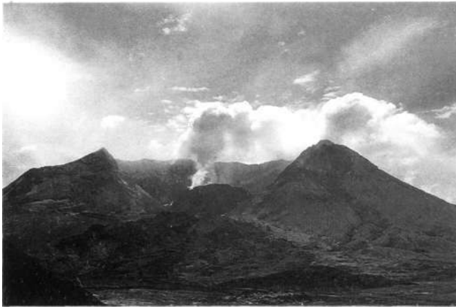
Figure 1. The newest lava dome within the horseshoe-shaped crater at Mount St Helens during its building process in August 1984.

1986 this newest lava dome had grown within the horseshoe-shaped crater to be an immense structure up to 350 m high and up to 1,060 m in diameter (see Figures 1 and 2). The lava dome formed by a complex series of lava extrusions, supplemented occasionally by internal inflation of the dome by shallow intrusions of dacite magma into its molten core. Extrusions of lava produced short (200-400 m) and thick (20-40 m) flows piled on top of one another. 2 Most dacite flows extended as lobes away from the top-centre of the dome, generally crumbling to very blocky talus on the flanks of the dome before reaching the crater floor (see Figure 3).