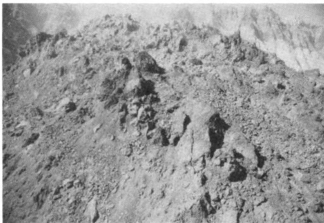
Figure 3. Blocky surface texture of the east side of the dacite lava dome above prominent talus slope (helicopter photo by S. A. Austin, October 1989).

grained gabbros with an average diameter of 6 cm. 11 The high mafic mineral content of gabbroic inclusions makes a small but significant decrease in the overall SiO 2 content of the dacite lava dome. 12