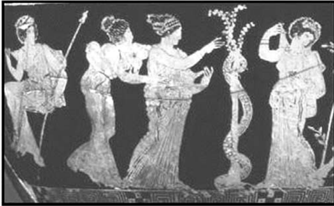
Figure 4. The Garden of the Hesperides

Zeus and Hera with its enticing ease, and with a serpent-entwined apple tree.