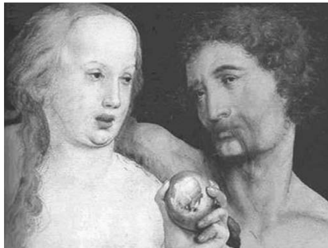
Figure 2. Hans Holbeins' Adam and Eve.

of all things. You may think to yourself that the Greeks are exalting gods, not man; but haven't you ever wondered why the Greek gods looked exactly like humans? The answer is the obvious one: for the most part, the gods represented the Greeks' (and our) human ancestors. Greek religion was thus a sophisticated form of ancestor worship. You have no doubt heard of the supposedly great philosopher, Sokrates. In Plato's Euthydemus , he referred to Zeus, Athena, and Apollo as his 'gods' and his 'lords and ancestors'. 1