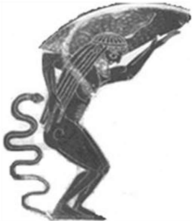
Figure 5. Atlas pushes away the heavens.

'And Atlas through hard constraint upholds the wide heaven with unwearying head and arms, standing at the borders of the earth before the clear-voiced Hesperides; for this lot wise Zeus assigned him.' 10