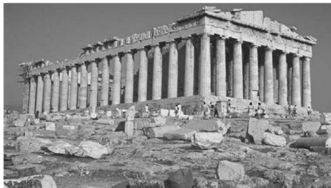
Figure 1. The Parthenon as it appears today atop the Akropolis of Athens, from the north-west.

There is no Creator-God in the Greek religious system. The ancient Greek religious system is about getting away from the God of Genesis, and exalting man as the measure