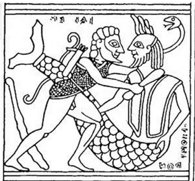
Figure 7. Herakles and Nereus, the 'Salt Sea Old Man'.

though the god turned himself into all kinds of shapes, the hero bound him and did not release him till he had learned from him where were the apples of the Hesperides. 18