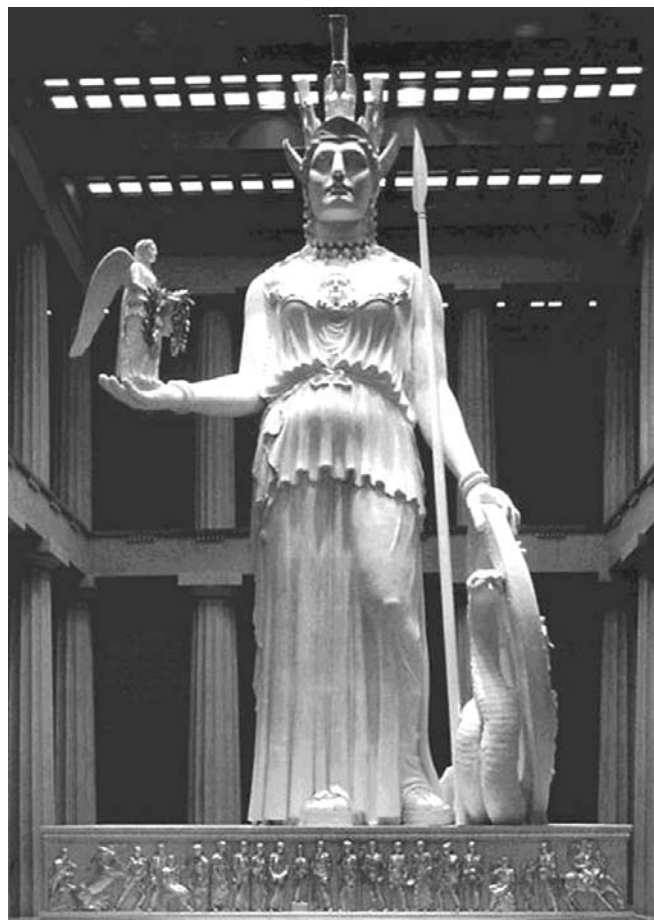
Figure 8. Athena Parthenos, full-size reproduction in the Nashville Parthenon by Alan LeQuire < www.Parthenon.org >.

Note that the serpent rises up next to Athena as a friend. In Genesis, Yahweh had condemned the serpent to crawl on its belly as a deceiver of humanity, yet all who entered