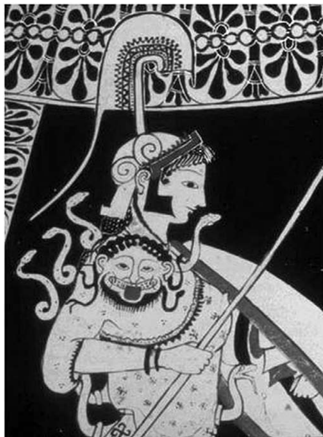
Figure 9. Athena depicted on an Attic red-figure vase from c. 525 BC. Her aegis is positioned over her right shoulder so that the face of the Gorgon head—the head of serpents—can be seen.

Athena’s true identity is so self-evident that she may as well have worn a sign around her neck saying, ‘Hello, I’m the serpent-worshipping Eve of Genesis.’ Why haven’t the great scholars of Greek myth been able to see something so