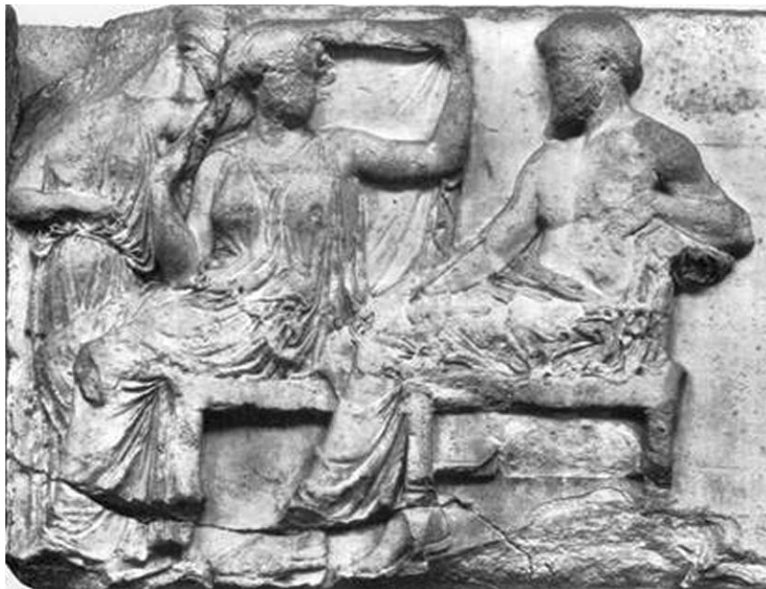
Figure 3. Hera and Zeus

On a Greek vase from c. 410 BC, a naked Zeus holds the sceptre of rule in his left hand and the lightning bolt in his right. 4 He is the naked and unashamed king of Olympus. The fruit of the tree—the serpent's enlightenment—has been passed to him. It is the true source of his power.