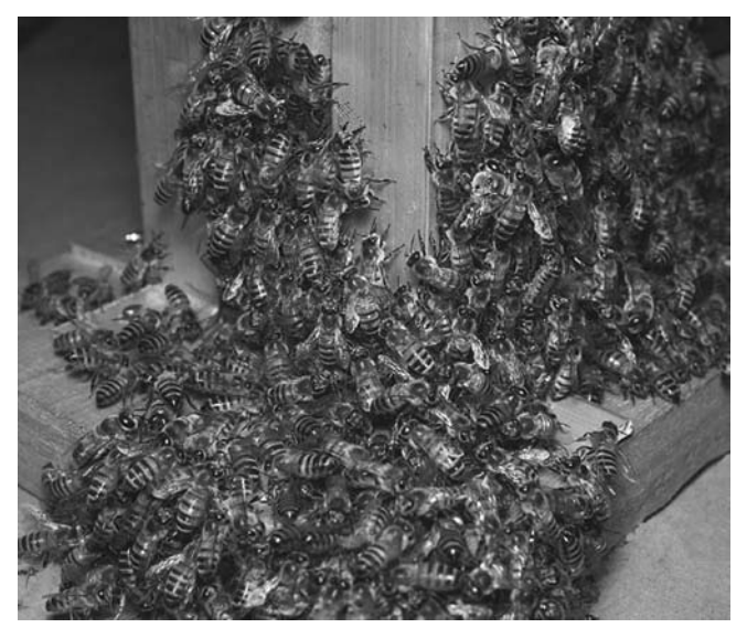
Figure 1. Bee colonies have two different female types and several different types of males.

The evidence for sexual selection is believed to be greatest among humans, because we are regarded by many