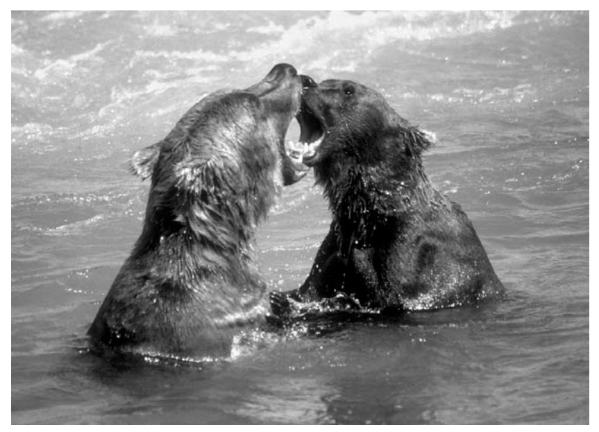
Figure 4 . Researchers are questioning many common Darwinistic assumptions, such as the belief that animals often fight each other for mates. It is not known why so many animals carry on behaviour that we have long assumed was part of a mating ritual.

develops'.<sup>57</sup> The old 'nature-as-wicked' approach is now rejected by 'a sizable number of naturalists' who have 'shifted towards nature-as-beneficent'.<sup>57</sup> Although the focus of this research is on competition and the struggle for food, much of the research has also been on the supposed competition for mates. Indeed, some researchers are questioning many common Darwinistic assumptions, such as the belief that animals often fight each other for mates. Actually, it is not known why so many animals carry on behaviour that we have long assumed was part of a mating ritual.