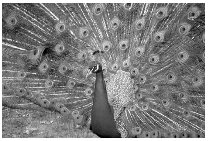
Figure 2. The tail of a healthy male peacock—a sexually selected trait—supposedly advertises its fitness.

'... sexually selected traits often depend on the overall fitness of the animal. A peacock that is infested with parasites is not likely to have a