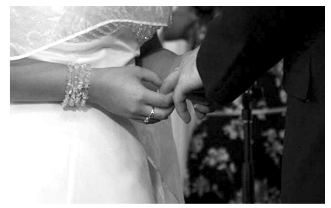
Figure 3. Christians and others disagree with the evolutionary claim that monogamous marriage is an artificial arrangement as far as the male is concerned.

'... the male will never come to terms with. He has voluntarily given up the opportunity to copulate with women to whom he is attracted. This hits home only after he has slipped the ring onto her finger. He realizes what he has done and won-