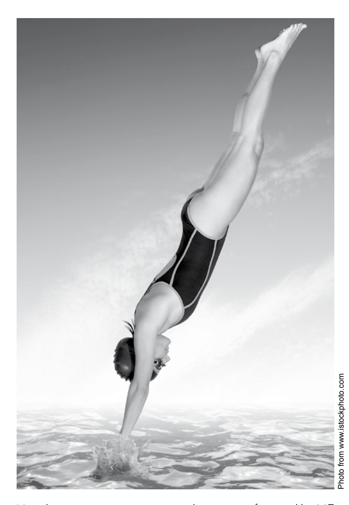
Many humans enjoy water sports and activities, a fact used by AAT supporters to argue for an innate love of water. Although humans can also hold their breath underwater, have the ability to swim at birth and have respiratory valves that allow swimming and water activities, good reasons exist for these traits for terrestrial life.

'... only satisfying explanation for these different adaptations of humans and nonhuman primates is provided by the Aquatic Ape Theory. It is the only model of human evolution that accounts for the numerous examples of convergent features between people and other vertebrates and the only model that explains these convergencies in connection with a well-defined ecological niche.<sup>41</sup>