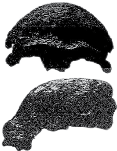
Figure 1. The Podkumok skull (top: frontal view; bottom: side view) has morphological affinities with the Neandertals, including a prominent continuous browridge and a receding forehead. (From Golomshtok, 17 Plate VII).

As demonstrated above, evolutionists believe the Neandertals were ‘gone forever’ 25,000 years ago at the latest, and so the appearance of the Podkumok Neanderthaloid 24 skull, at the very minimum 11,000 years after the last Neanderthal supposedly died, must question their theory on the origins of modern humans. Whether