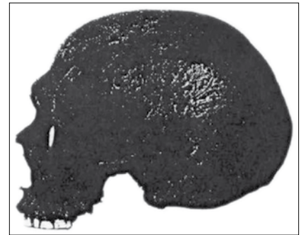
Figure 4. The Nowosiolka skull (side view) was reported to contain numerous characteristics only associated with Neandertals, including a large browridge. (From Stolyhwo 35 ).