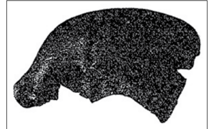
Figure 3. The Undora II skull (side view). Neandertaloid features of this skull include a sloping forehead and a dolichocephalic (longheaded) shape. (From Golomshtok 17 ).