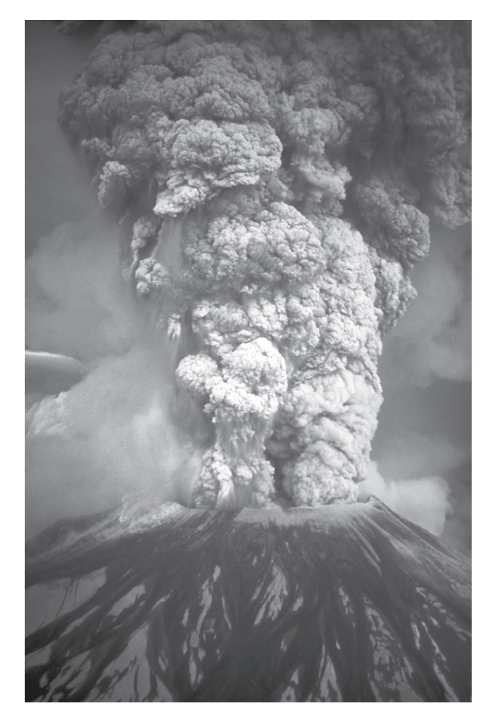
Life-destroying volcanic eruptions such as Mt St Helens occur due to Adam's sin and the whole creation subsequently being 'subjected to futility'.

The only alternative is to choose God as the subjector.<sup>4,35,44</sup> If the subjection took place during the creation of the