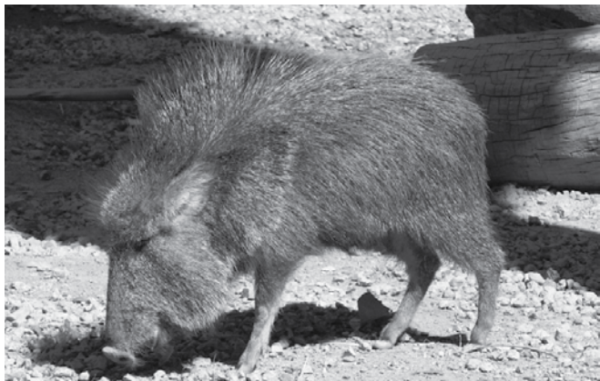
Figure 2. A Chacoan peccary Catagonus wagneri in Phoenix Zoo, Phoenix, AZ. This animal was once thought extinct and is similar to the peccary the Nebraska tooth came from.

fieldwork in Nebraska in the spring of 1925 and began to uncover evidence that what was actually found in the soil of this State was the tooth of a peccary, a type of pig (figure 2). But this work was not written up until 1927, after the Scopes Trial had ended.