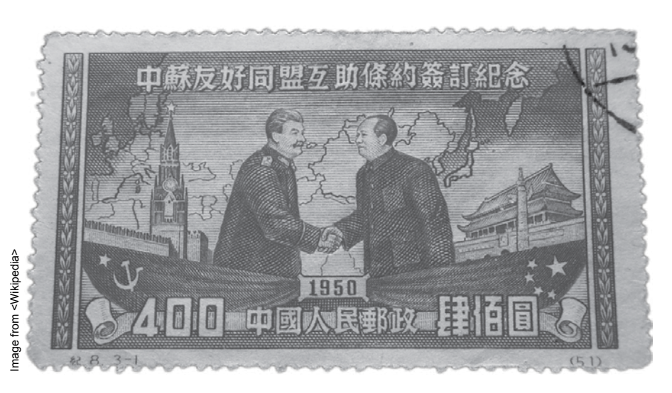
Atheists blame religion for the Crusades and Spanish Inquisition, but atheist regimes in the 20<sup>th</sup> century have killed far more people than all religiously-caused 'atrocities' combined.