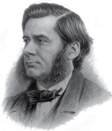
Figure 1. Thomas Henry Huxley in 1874.

Like Darwin, Huxley had spent time at sea as a naturalist and was later tasked with examining collected samples, including those collected from the deep sea floor by H.M.S. Cyclops in 1857. Sea floor sediment had been collected and preserved in alcohol for later study. The task of the Cyclops incidentally had been to lay telegraph cables between Britain and America. Upon examination, Huxley noticed something apparently odd about one sample. He observed that a thin film of jelly like mucus had collected on the top of the sediment as embedded tiny granules. These granules appeared to move when examined under a microscope. As a result he thought he had found the original protoplasm of life in the gelatinous ooze. Protoplasm was at the time believed to be an organic substance that formed the basis of life, and therefore something of this nature, found in ocean sediment, suited the evolutionary speculation of the period (see figure 2). Haeckel had recently proposed that such an entity existed as the precursor of life, and Huxley rather excitedly wrote to Haeckel in October 1868 the following comments offering to name the new ‘Moner’ after him.