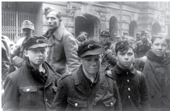
Nazis especially focused on persuading German youth to leave Christianity and to embrace their ideology.

Once children were conscripted into the Hitler Youth, they were taught that Christianity was a useless superstition, and that praying and going to church was a waste of time. “The Hitler Youth was intended to pound Christianity out of children” (p. 54). They understood that if they gained the minds of the youth that they