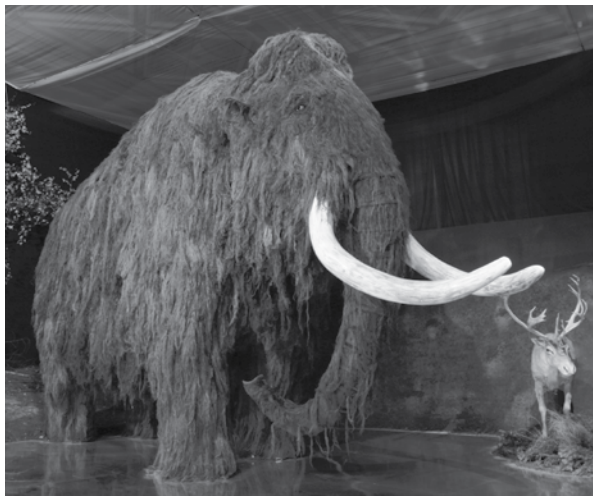
Figure 2. Replica of a woolly mammoth at the Lovci mamutuz exhibition at the National Museum in Prague.

become severely cold. The late Ice Age would also be drier than today and characterized by strong windy dust storms. Blowing dust can explain many of the observations of woolly mammoths from Siberia. 3,10 Because of the cold and dust storms, and drought in many areas, the animals that thrived earlier during the Ice Age were severely stressed. These are the main reasons so many animals, including the woolly mammoth, became extinct at the end of the Ice Age.