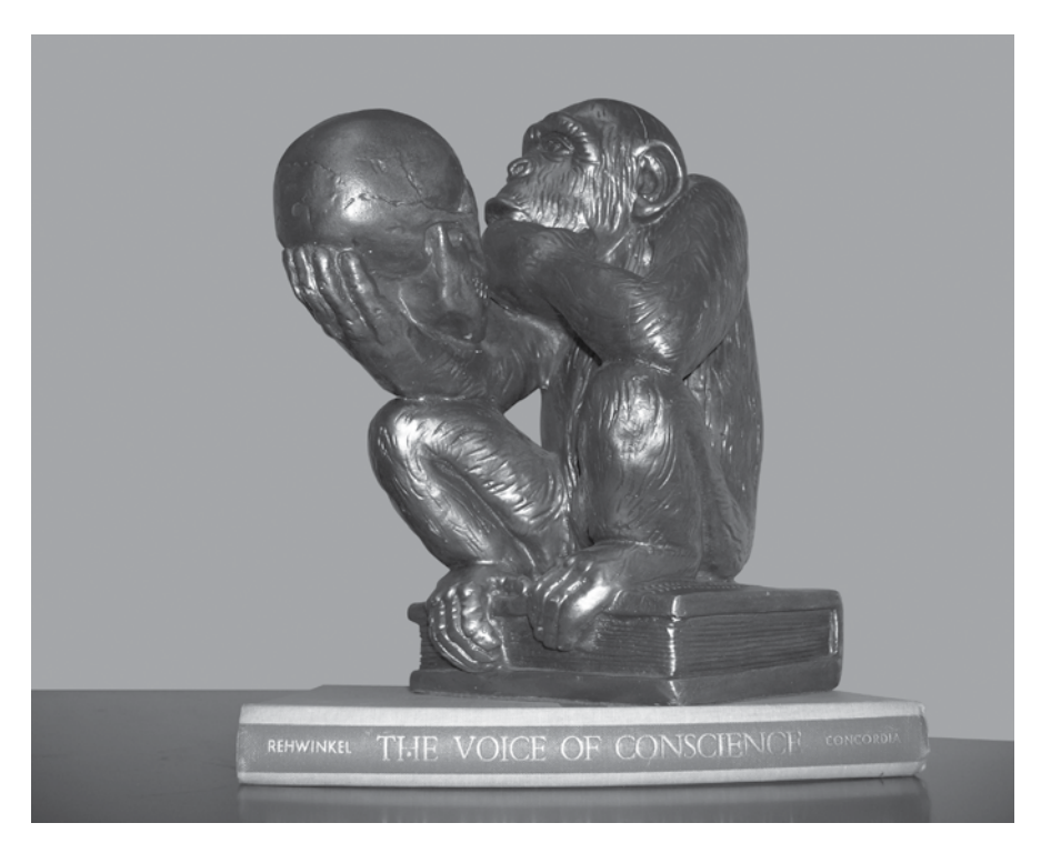
Figure 1. The will of atheists to live in sin has been the primary incentive behind their will to reject God.

Unfortunately, Spiegel admits that Christians ought to agree with atheist objections that past Christians are guilty of murder, abuse, oppression, slavery, torment, and torture, all motivated by the Bible. Most of the cases that New Atheists cite actually show that these evils were motivated not by Scripture, but by evil human intentions perhaps seeking justification from the Bible for their crimes. Thus, although we can agree with Spiegel that it is certainly our duty to admit faults, nevertheless the New Atheists' spin on Christian history is grossly inaccurate, and thus not necessary to repent of. Further, atheists in the last century alone have murdered thousands as many people as in the 'religious' wars and inquisitions of all previous centuries combined.