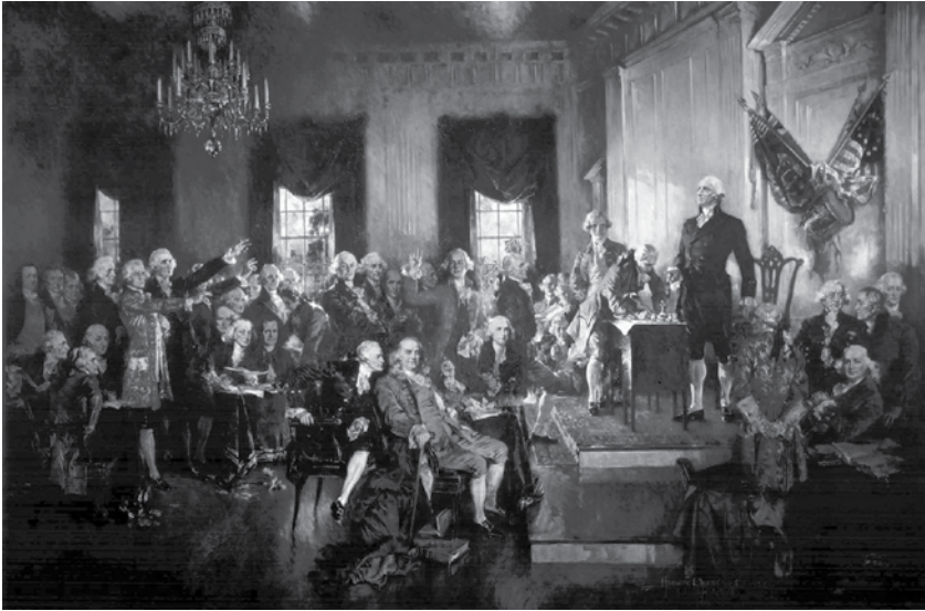
Figure 2. The understanding of the Founding Fathers, at the time they ratified the Constitution, must be of supreme importance when defining the terms in that document.

with members of the Court going so far as to state, “The line we must draw between the permissible and the impermissible is one which accords with history and faithfully reflects the understanding of the Founding Fathers.” 25 In determining whether a theory acknowledging the existence of a deity is a religious exercise as opponents of ID have claimed, then, one must turn to the understanding of the Founding Fathers. In Reynolds vs United States , 26 the Court noted that, because the word ‘religion’ is not defined in the Constitution, “We must go elsewhere, therefore, to ascertain its meaning, and nowhere more appropriately, we think, than to the history of the times in the midst of which the provision was adopted.”