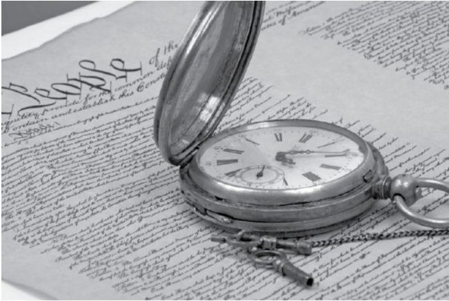
Figure 3. A proper understanding of the Establishment Clause that will remain consistent through the ages will always be based on the history surrounding its ratification.

declarations and amendments submitted during the state ratifying conventions, which held that the government should be prohibited from compelling religion by “force or violence”. 56