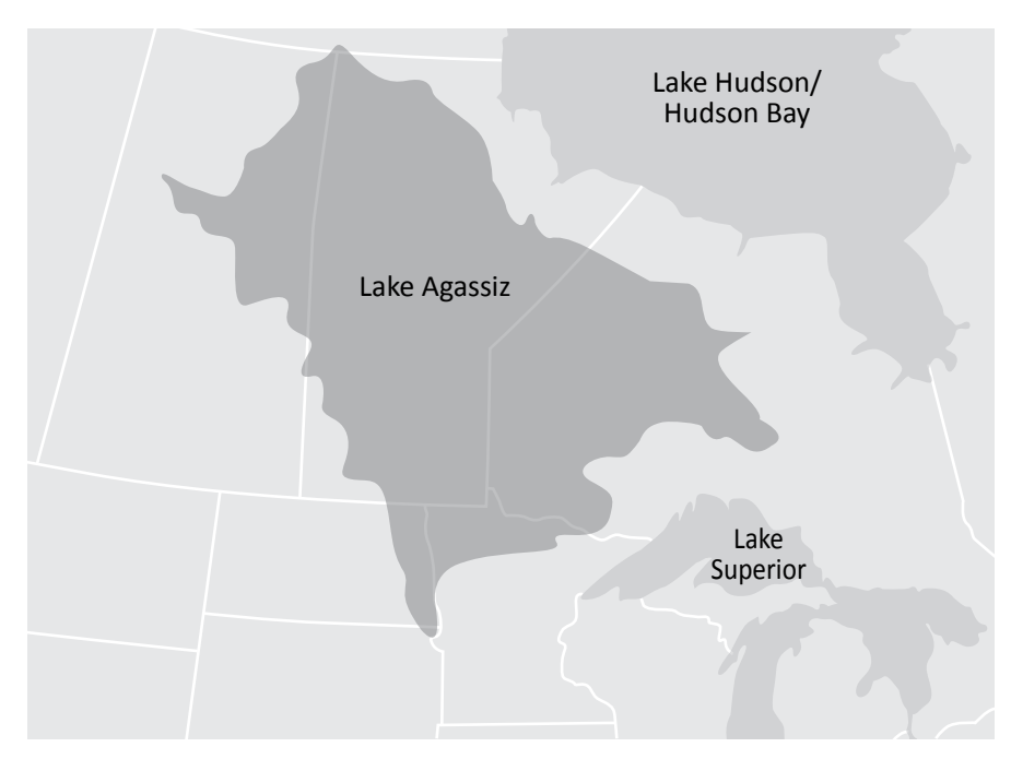
Figure 2. A mega-flood, caused by the melting of the Laurentide ice sheet, which covered much of North America, emptied ancient Lake Agassiz sending floodwaters into Hudson Bay, Lake Superior and across North America.

either directly through the St Lawrence Seaway or indirectly through the Arctic Ocean, likely would not stop the thermohaline circulation. Besides, one megaflood, even into the North Atlantic, likely would not be significant enough to stop the circulation because of the large size of the North Atlantic Ocean.