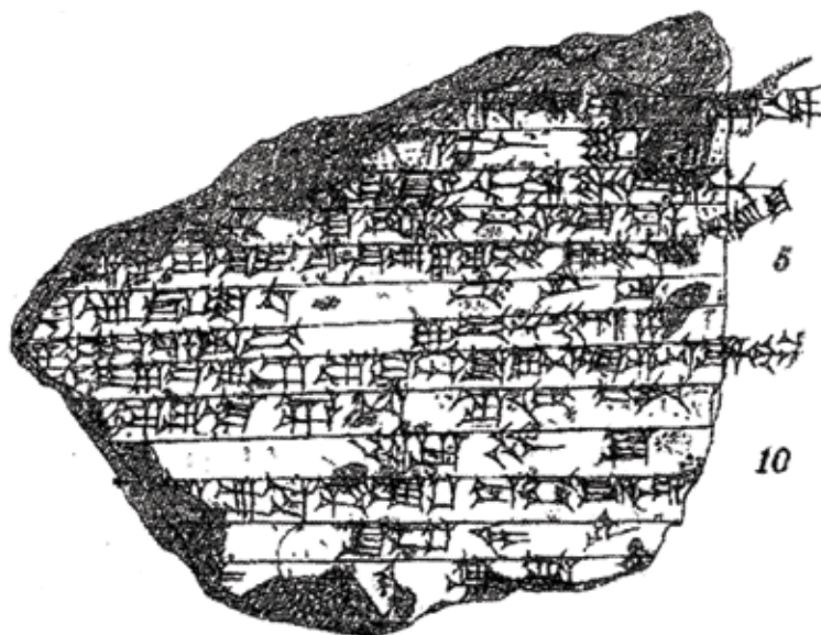
Figure 1. Tablet fragment from the Temple Library of the ancient Sumerian city of Nippur (c. 2100 BC). Discovered by the University of Pennsylvania and translated by Hermann Hilprecht, its account of the Flood agrees with Genesis in every detail.

Cooper presents compelling evidence that the modernists' claim, that the Babylonian Flood legend is the source of all other Flood legends, is false (pp. 386–396). For example, in the last decade of the 19 th century, an archeological dig by the University of Pennsylvania unearthed a tablet fragment from the ancient Babylonian city of Nippur (figure 1). It contains the Flood narrative and, most significantly, is dated to at least 2005 BC—centuries older than the original text of the Gilgamesh epic. It is written in Semitic Babylonian and is therefore closely related to biblical Hebrew. Indeed, its phraseology is so close to the Genesis text that its translator, Professor H.V. Hilprecht, wrote: