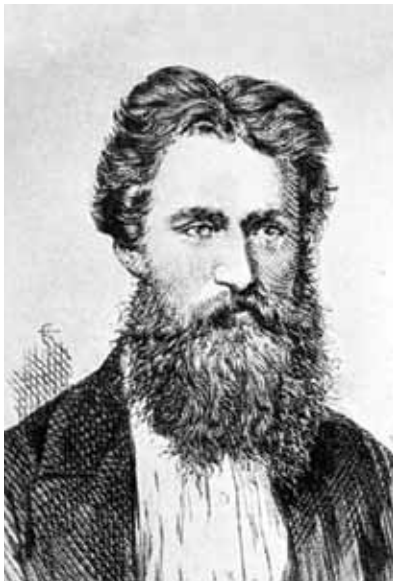
Figure 2. The Assyriologist George Smith (1840–1876) who first discovered and translated the Epic of Gilgamesh . Smith was a Bible believing Christian who worked at the British Museum. Before he died at the young age of 36, he had started to inform the public of the many ancient documents that confirm the historicity of Genesis.

Needless to say, the modernists understand it to be nothing more than an elaborate work of fiction. A popular view is that it was copied from pagan sources around the 5 th century BC, during the 'Persian period'. This, however, seems most unlikely.