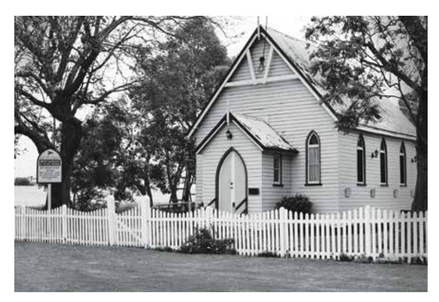
Figure 1. Sign of the times. The church's declining influence has led to declining numbers. Many once vibrant churches have now been converted to restaurants and even nightclubs.

evolution borders on deism since the god of the theistic evolutionist is distant and impersonal.