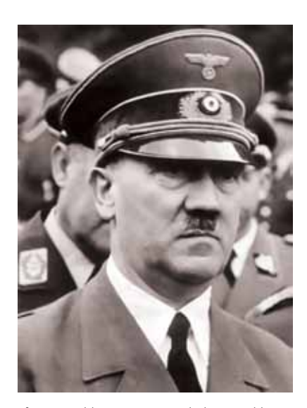
Figure 1. Hitler was not an atheist, occultist, or orthodox Christian; he was a heretic.