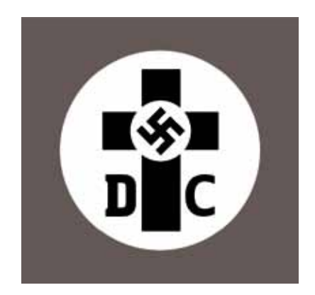
Figure 3. The flag of the 'German Christians' (Deutsche Christen) movement. It was the institutional face of the Positive Christian heresy which Hitler advocated—it rejected most of the biblical canon, it denied Jesus' Jewishness, and it emphasized ethics at the expense of doctrine.

In chapters 9–12, Holding addresses a number of associated concerns and objections to his main thesis. In chapter 9 he identifies and discusses a number of sources for Hitler's religious beliefs that historians have for various reasons deemed questionable. Much of what he discusses is used as 'smoking gun' proof of Hitler's hostility to Christianity. Different sources pose different concerns—some have questionable objectivity, reliability, or even accessibility to Hitler. However, they paint a picture little different from what can be gleaned from sources