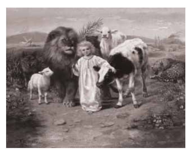
Figure 3. Painting by William Strutt, Peace, on the Isaiah passage.

As with Irenaeus and Chrysostom, one finds the expectation with Theophilus that, eventually, in the fullness of time, the evil consequences of the Fall for the animal world will be undone. For him God's eschaton means the final restoration, not only of mankind, but of animals as well.