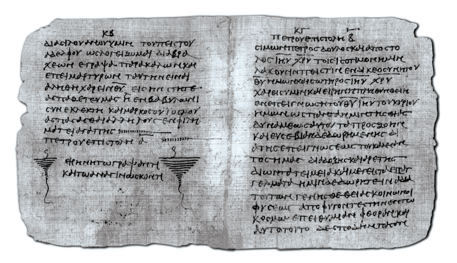
Figure 2. Ancient conventions of authorship allowed the use of a scribe or amanuensis to aid in the composition of a document.

And 2 Peter was eventually accepted by the fourth-century councils, which excluded other works claiming to be by Peter, as well as other edifying but pseudonymous works, so the councils