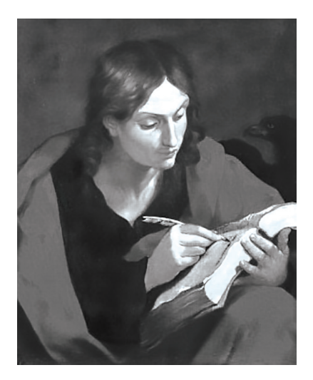
Figure 1. There is good, early evidence for the New Testament's Apostolic authorship.

and condemn them equally. That a document was lying about its authorship was reason enough to reject it, regardless of whether its contents were following traditional Christian teaching. But, interestingly, we know of no instance of heretics having this attitude toward their obviously pseudonymous writings.