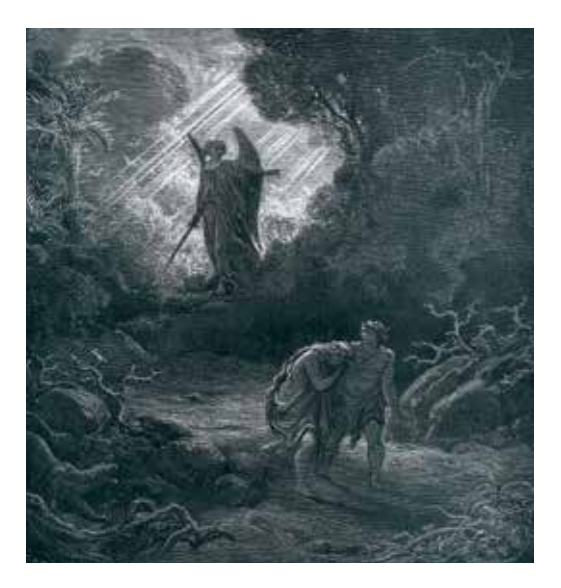
Figure 2. The Fall is an integral part of the redemptive historical narrative of Scripture. Without it, Jesus' death is meaningless.

Detractors could easily see this chapter as diagnosing a problem that doesn't exist. That however would ignore the previous three chapters. Horner helpfully stresses the pastoral